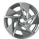
18" Granite Grey