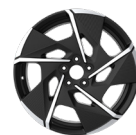
18" Granite Black