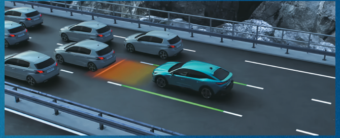
Driver assistance systems enhance comfort and sense of calm when driving