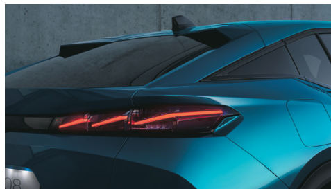
The rear light cluster simulates 3 lion claws