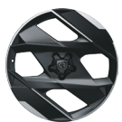
20" Monolithe Black

Up to 7 years warranty* / 200,000 KM, whichever comes first.