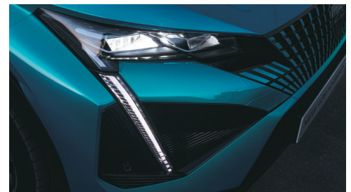
The front lights simulate lion fangs