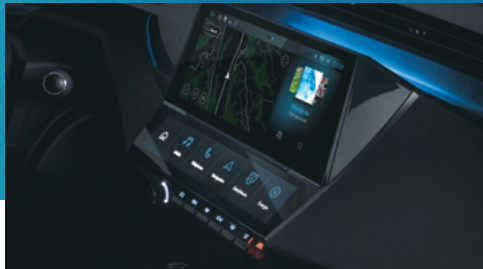
New configurable PEUGEOT i-Toggles® to give quick and intuitive access