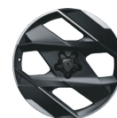
20" Monolithe Black

Up to 7 years warranty* / 200,000 KM, whichever comes first.