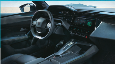
The latest generation PEUGEOT 3D i-Cockpit® with new design and technology