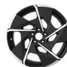
18" Granite Black