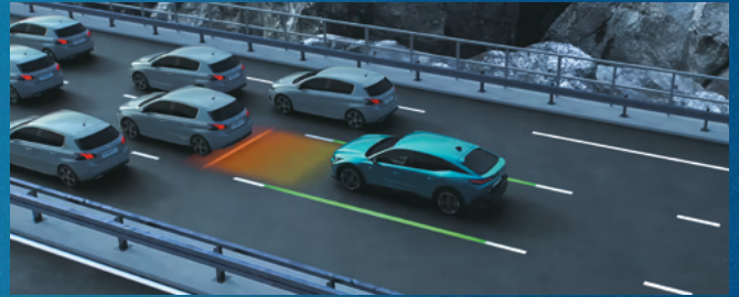
Driver assistance systems enhance comfort and sense of calm when driving