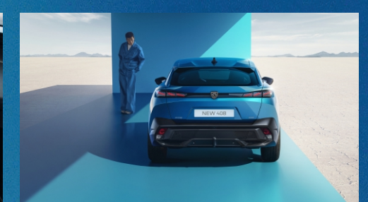
UNEXPECTED REAR END DESIGN

Optimised connectivity with Bluetooth and Innovative full LED or 3D full LED rear lights USB plug-ins