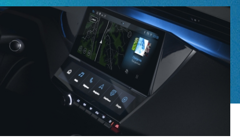
New configurable PEUGEOT i-Toggles® to give quick and intuitive access