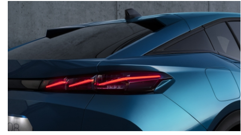
The rear light cluster simulates 3 lion