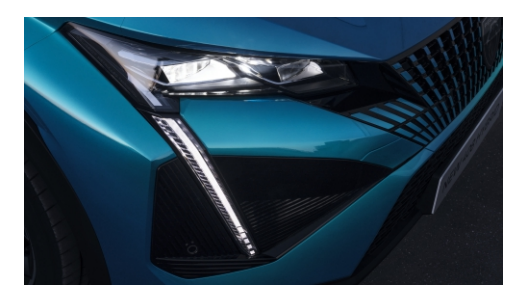
The front lights simulate lion fangs