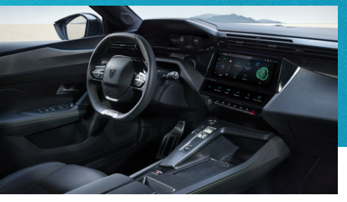
The latest generation PEUGEOT 3D i-Cockpit® with new design and