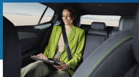
Top of the range comfort for driver and passenger