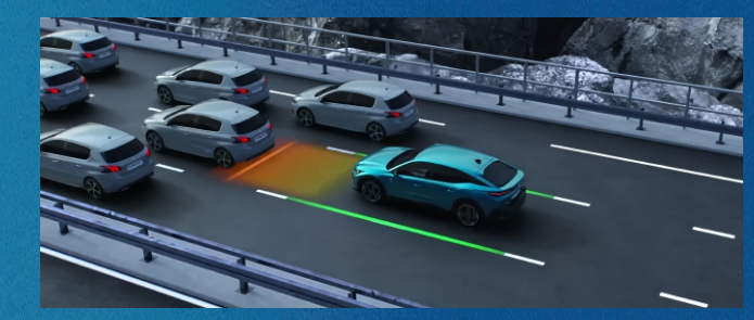
Driver assistance systems enhance comfort and sense of

Experience the magnetic 408. Stunning design, uncompromising quality and a dynamic drive.