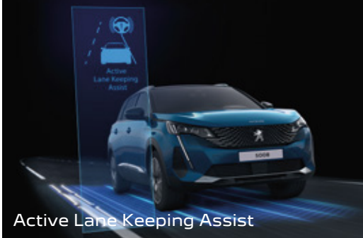
Active Lane Keeping Assist