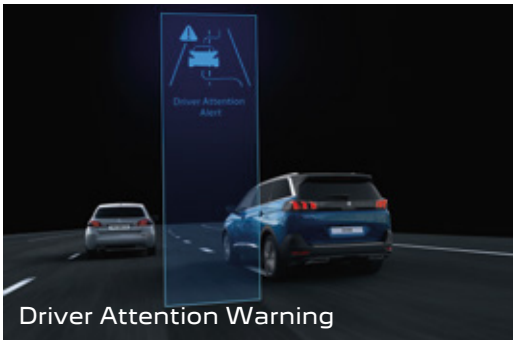
Driver Attention Warning