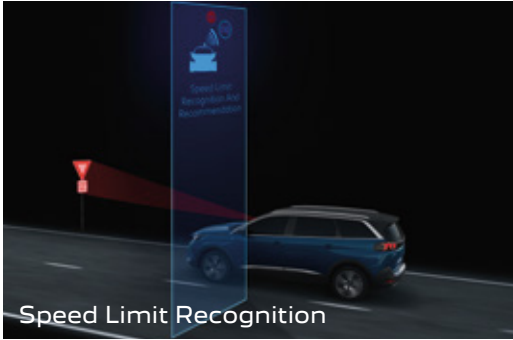
Speed Limit Recognition