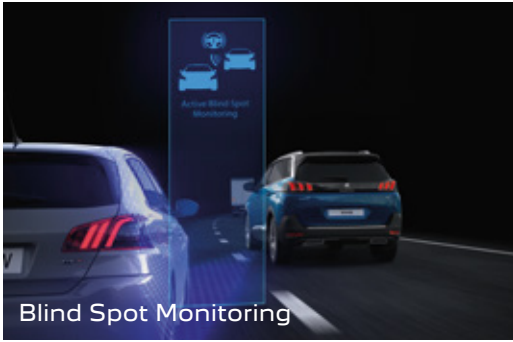
Blind Spot Monitoring